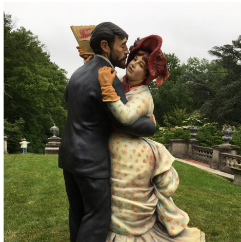
Time for Fun, 2000

Summer is the season of family, friends, food and fun at Old Westbury Gardens.