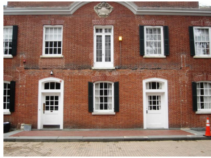
Rendering of Service Wing with Portico and Service Wing area before restoration

Old Westbury Gardens was selected to receive this grant as a result of its continued dedication to protecting New York's rich heritage and its ongoing community education programs to engage current and future generations in its mission of historic preservation.