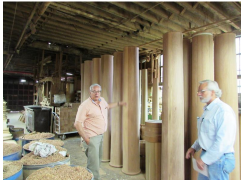
Offsite construction of columns

The service wing was the main entrance for domestic operations at Westbury House. It was designed and built to provide additional accommodations for staff, food preparation areas, dumbwaiters, silver vaults, linen storage and the servants' dining room.